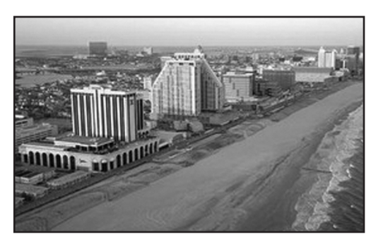
Tropicana Hotel In Atlantic City Hosted the 15th Annual Retiree Gathering.